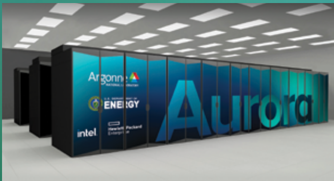
Aurora's ability to handle simulation, data analysis, and artificial intelligence workloads will give researchers an unprecedented set of tools to advance scientific discovery.

The ALCF and the ECP offer several training opportunities, including workshops, webinars, and hackathons, to help researchers prepare for Aurora and other DOE exascale systems. Stay tuned to the ALCF and ECP websites for upcoming opportunities.